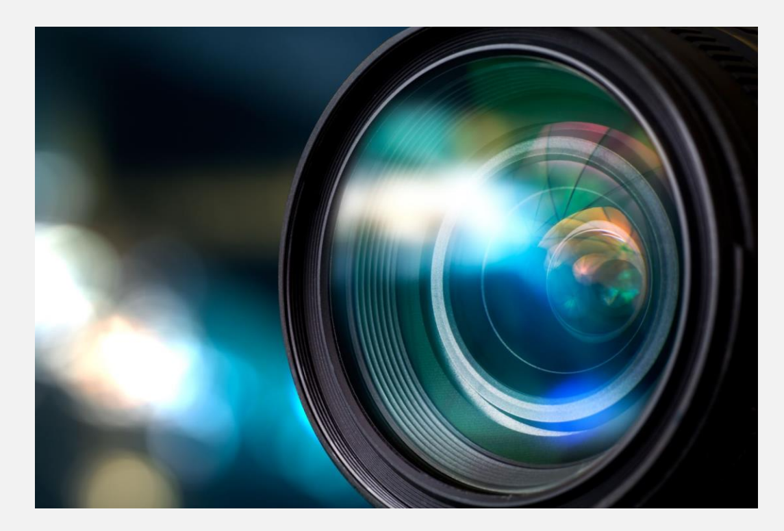
Video Excerpt: Texas Competency Restoration Guide

Part of the Texas Behavioral Health and Justice <u>Texas Competency Restoration Guide</u>. <u>https://txbhjustice.org/</u>